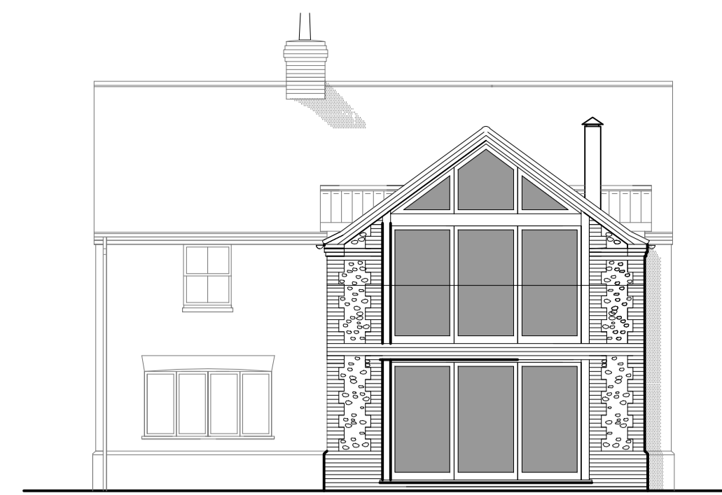
Rear Elevation (1:100)