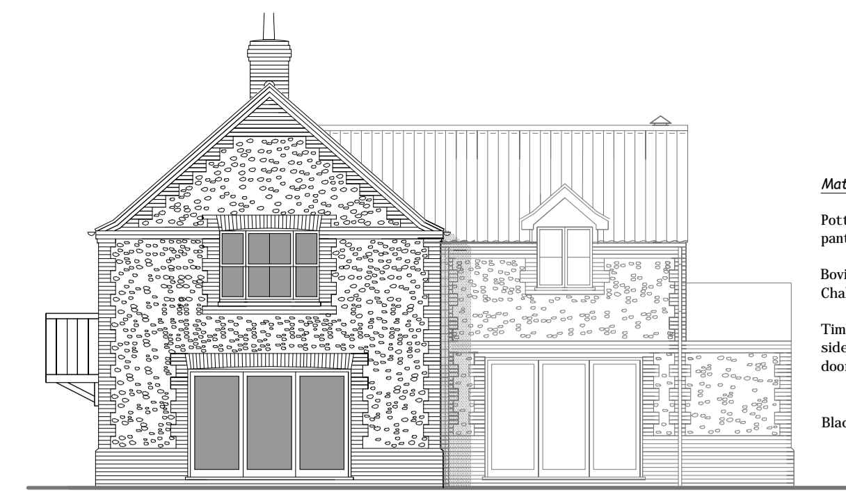
Side Elevation (1:100)

Materials Pottelberg Ceramic Victorian Clay pantile roof tiles Bevington Blend Brick with random Chalk & Flint infill Timber framed windows and front and side doors + Aluminium framed doors/screens elsewhere Black Alumasc guttering and downpipes