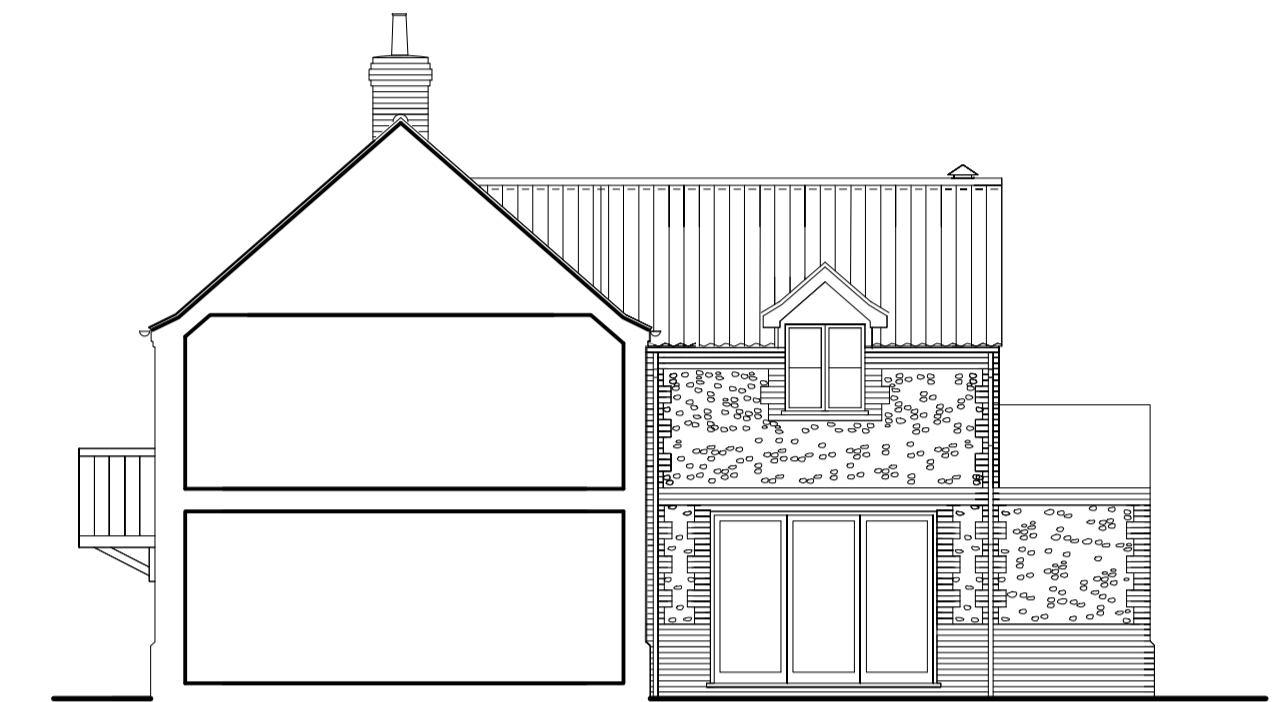
Section / Side Elevation (1:100)