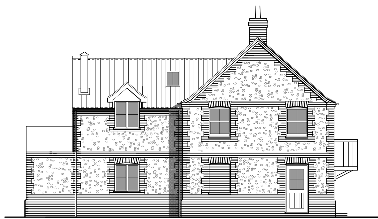
Side Elevation (1:100)