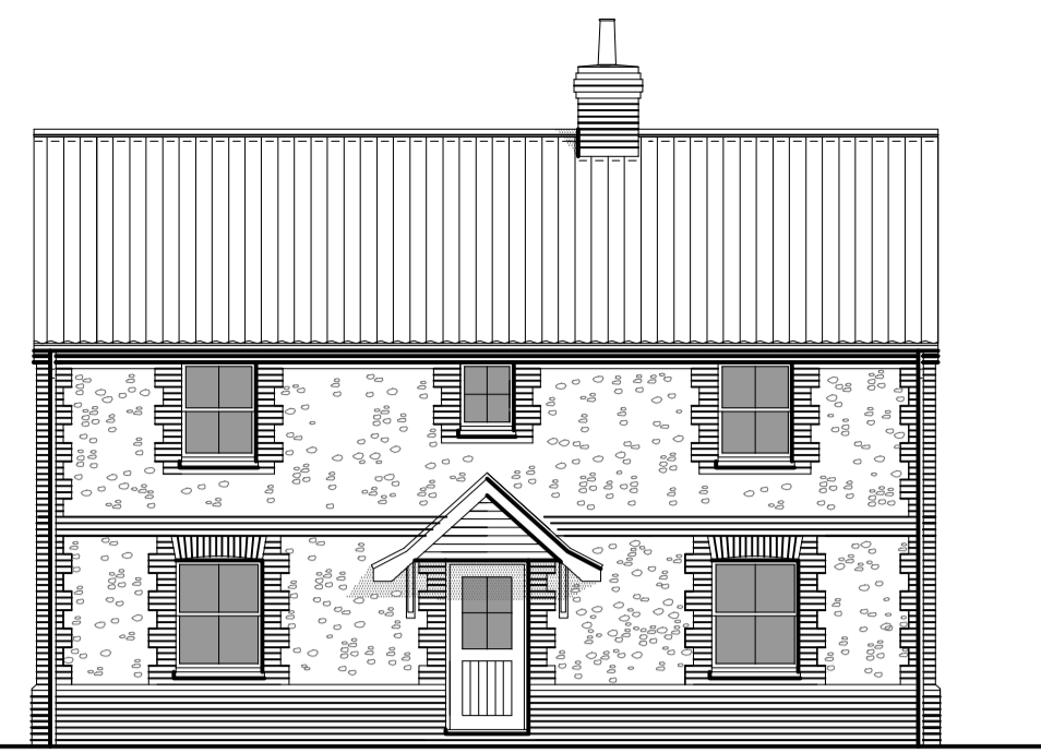
Front Elevation (1:100)

Allow to provide provision for bat boxes, 6 No. on two trees (3 per tree) within the garden to the property - 2022 install prior to commencement of any development.